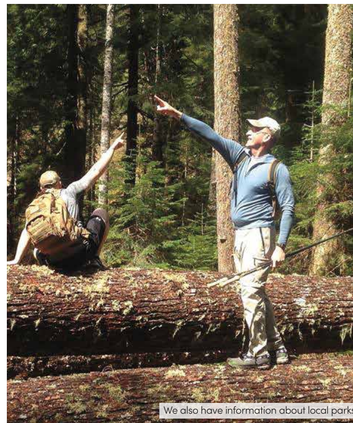
We also have information about local parks