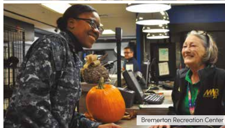
Bremerton Recreation Center