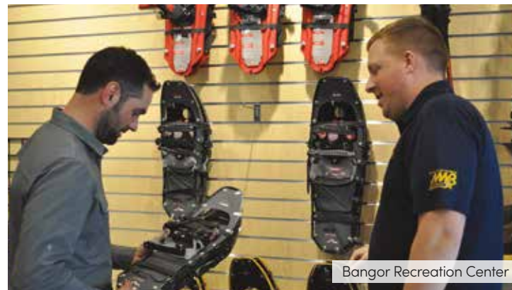
Bangor Recreation Center