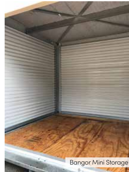
Bangor Mini Storage