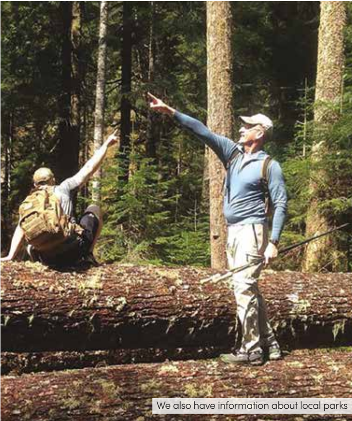
We also have information about local parks