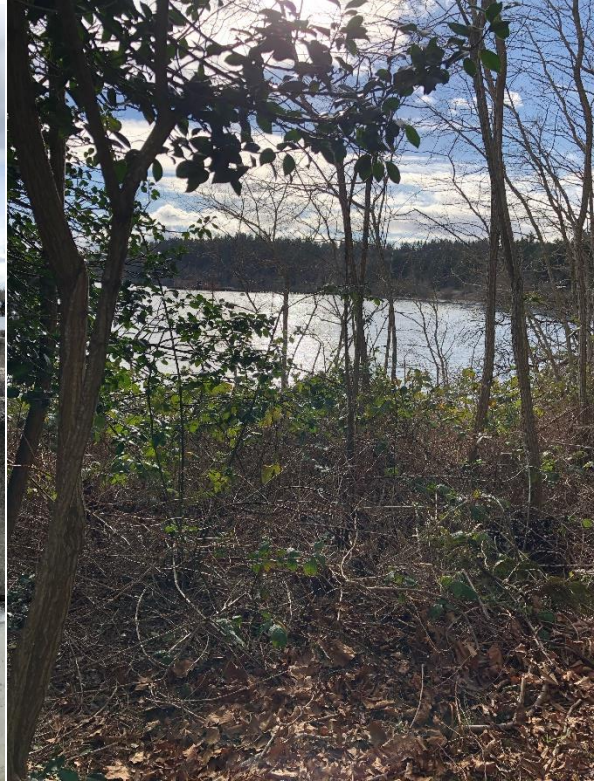
Orange Geocache Clue