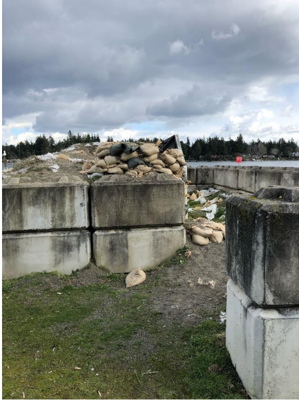
Red Geocache Clue